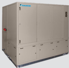
Self-Contained packaged vertical systems