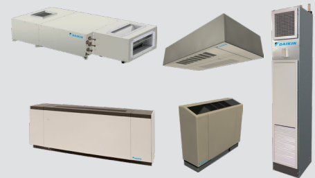
PrecisLine®/OptiLine™ fan coils, unit ventilators