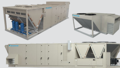
Rebel®/ Rebel Applied™/Maverick® II rooftop systems