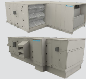
Vision®/indoor air handlers, Skyline® outdoor air handlers