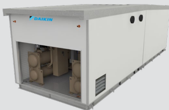
Modular central plants