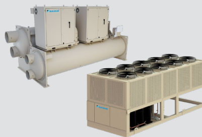
Magnitude® water-cooled chillers, Trailblazer® air-cooled chillers