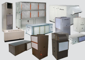
Water source heat pumps