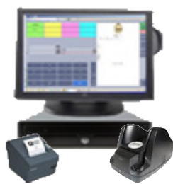
Quick Modules Cashier Workstation