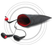
Thinkpad® In-ear Headphones