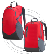
Active backpack large and medium