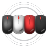
ThinkPad® Precision Wireless Mouse