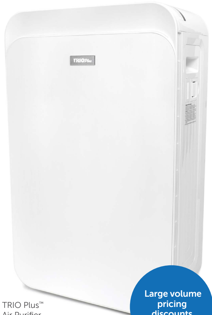
TRIO Plus™ Air Purifier Item #2083070

Sanitize even a spacious room with the high-capacity airflow and multi-stage filtration of the TRIO Plus™ UVC & HEPA Equipped Air Purifier. It cleans the air in a 775 square-foot schoolroom three times every hour. Three state-of-the-art technologies intercept airborne microorganisms and viruses with quiet efficiency, so learning can proceed without interruption.