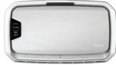
AERAMAX PRO 4

19.6" h x 20.9" w x 9" d 300-500 sq ft. coverage* 5 Year Warranty 20.2 lbs. | 2 amp