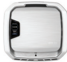
AERAMAX PRO 3

22.6" h x 14" w x 4.1" d 135-225 sq ft. coverage* 3 Year Warranty 10.6 lbs. | 1.4 amp