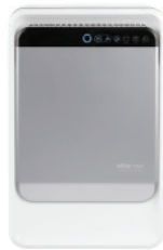
AERAMAX PRO 2

Constructed with superior components, high-grade filters and reinforced housing.