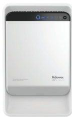
Fellowes AeraMax Pro AM2 Air Purifier

Constructed with superior components, high-grade filters and reinforced housing.