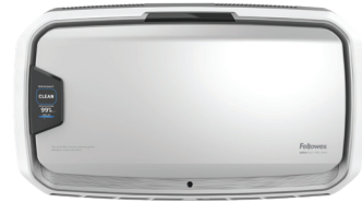
Fellowes AeraMax Pro AM4 Air Purifier

22.6" h x 14" w x 4.1" d 150-250 sq ft. coverage* 3 Year Warranty 10.6 lbs. | 1.4 amp