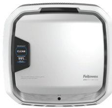
Fellowes AeraMax Pro AM3 Air Purifier