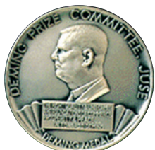
DEMING PRIZE 2003