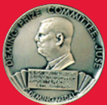
DEMING PRIZE 2003