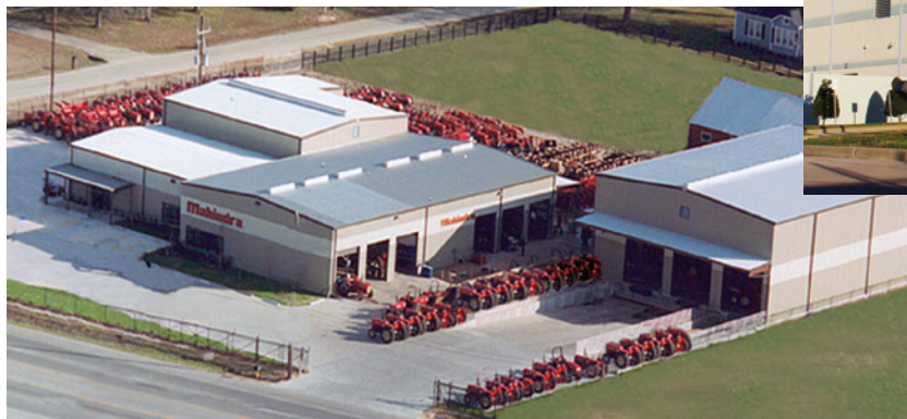
Mahindra Corporate Headquarters - 2003 Tomball, TX

In 2003, MNA opened a second assembly and distribution center on the East Coast. In 2005, we opened a third on the West Coast. This plant helped MNA more than double our production capacity to meet the growing demands for our tractors. In 2012, MNA moved into a larger North American Corporate Headquarters at a class-A corporate facility that consolidated our distribution, parts and business functions under one facility. Today, Mahindra North America has assembly and distribution centers in Texas, California, Tennessee, Pennsylvania, Kansas and Quebec.