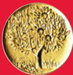
JAPAN QUALITY MEDAL 2007