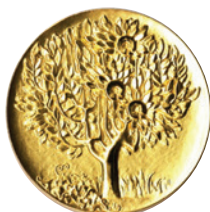
JAPAN QUALITY MEDAL 2007

Mahindra North America is the only tractor manufacturer in history to win the Industry's Top Two Quality Awards