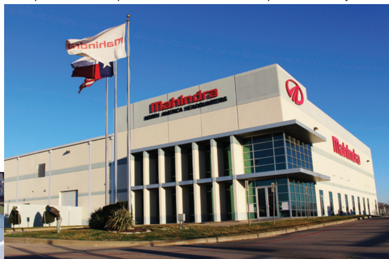
North American Corporate Headquarters - 2012 Houston, TX