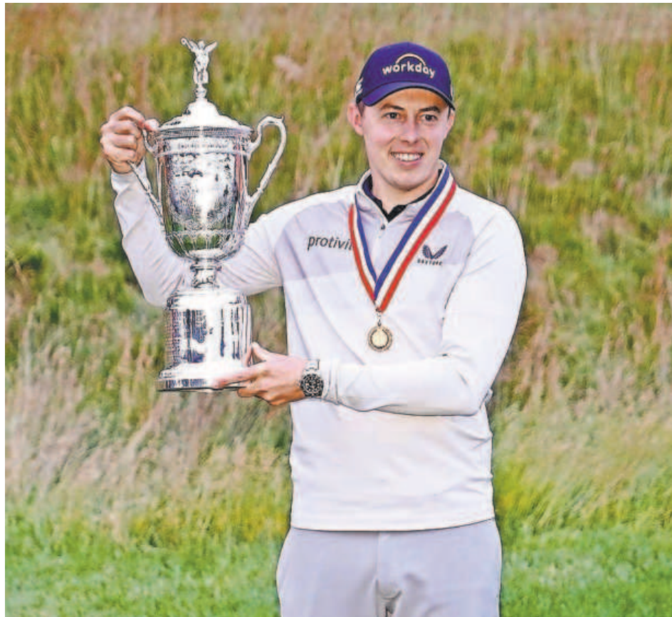
With his victory in the U.S. Open, Englishman Matt Fitzpatrick has risen from No. 18 to No. 10 in the Official World Golf Ranking.

On demanding golf courses like Southern Hills last month during the PGA Championship and this past week at The Country Club, which featured thick rough and fescue along the fairways, he ranked fifth in driving accuracy