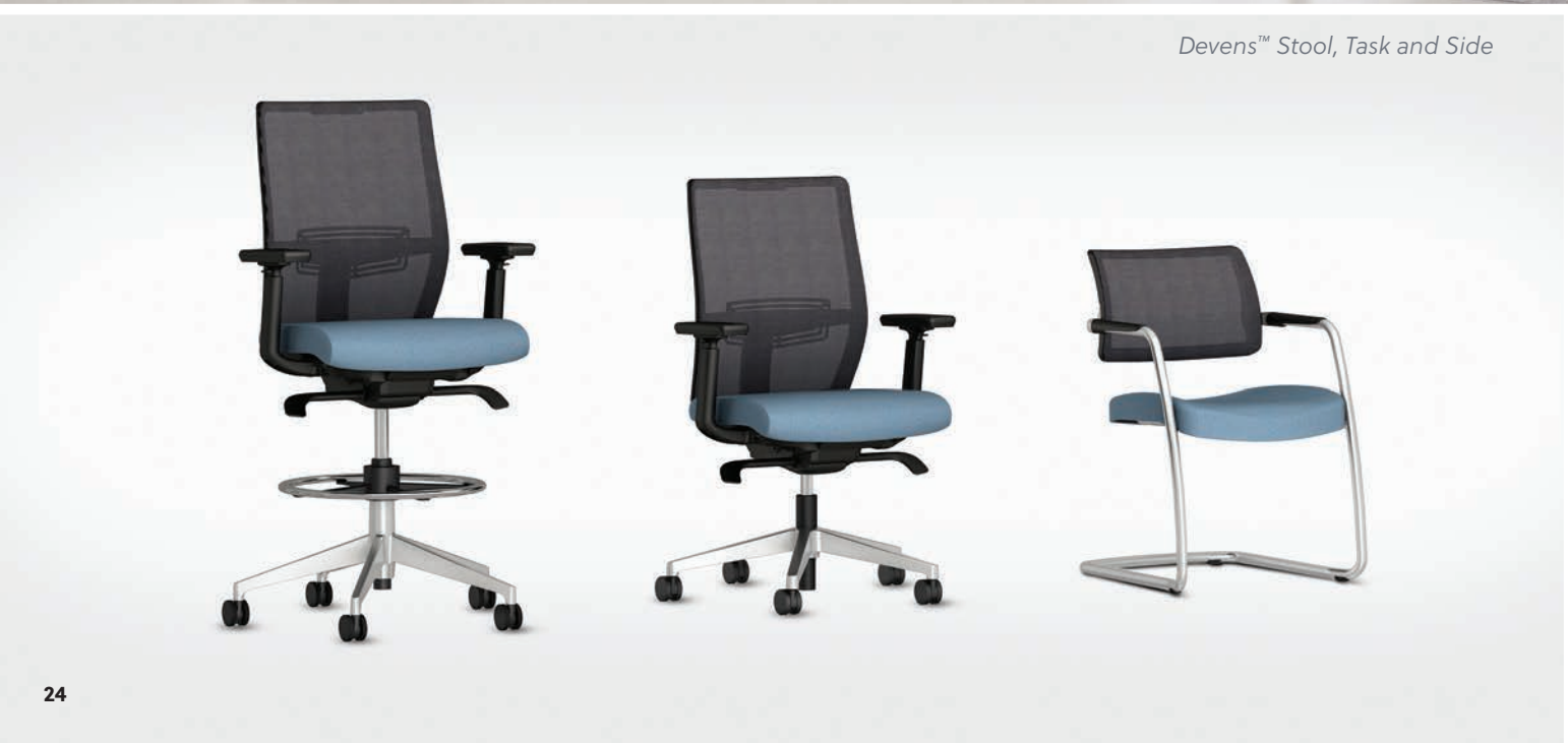
Devens™ Stool, Task and Side

SEATING EVERYWHERE FROM THE CAFE TO THE CORNER OFFICE