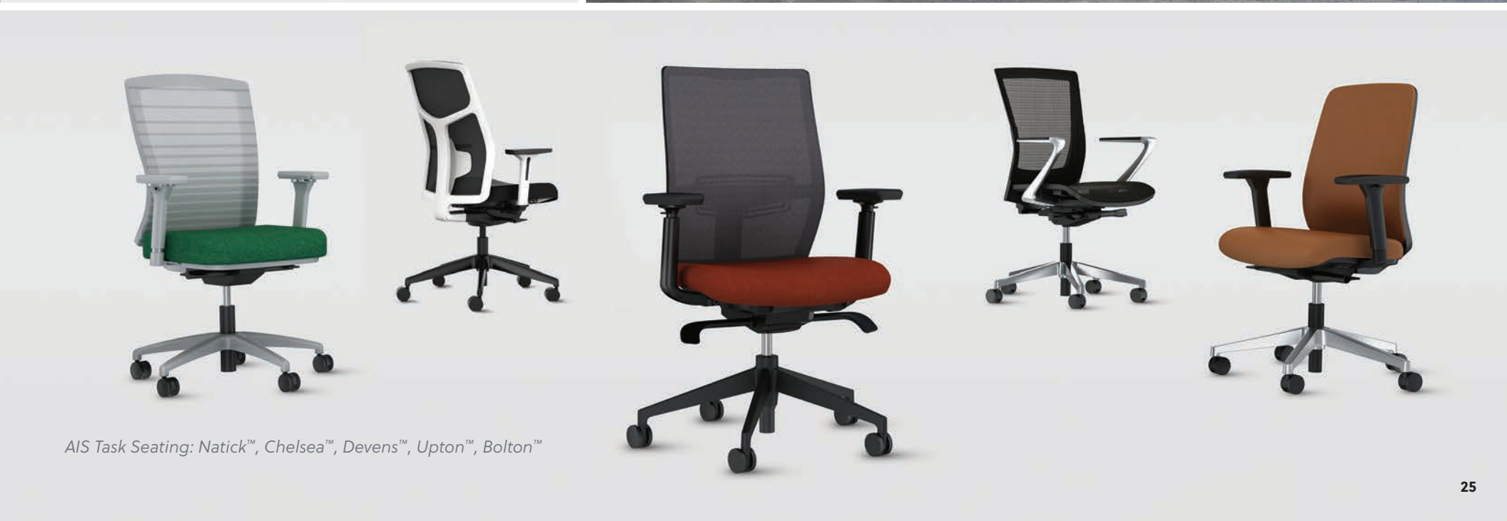
AIS Task Seating: Natick™, Chelsea™, Devens™, Upton™, Bolton™

SEATING EVERYWHERE FROM THE CAFE TO THE CORNER OFFICE