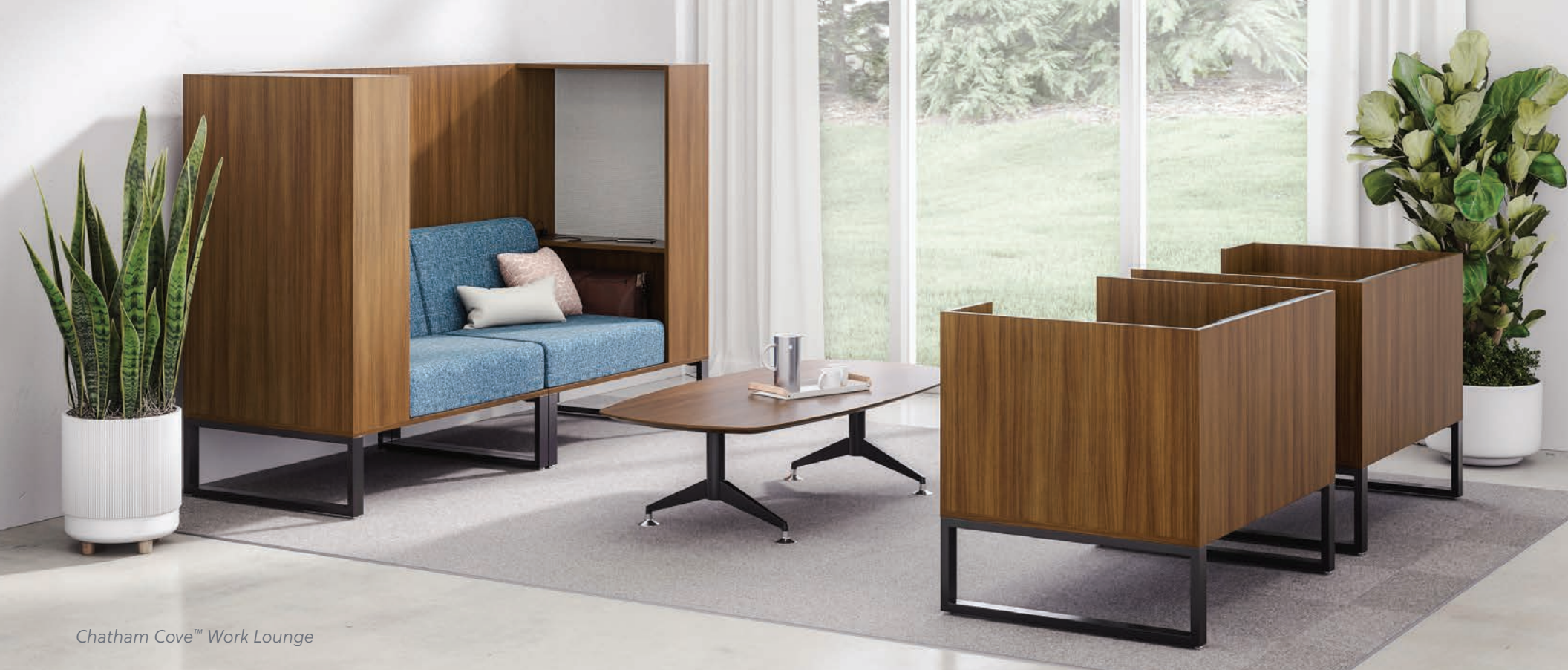
Chatham Cove™ Work Lounge