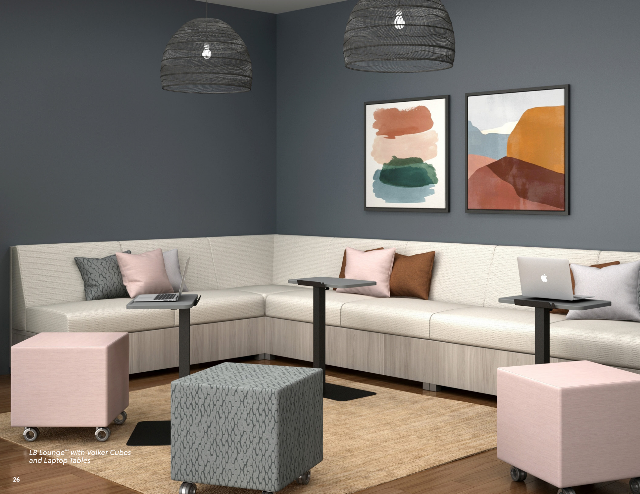
LB Lounge™ with Volker Cubes and Laptop Tables