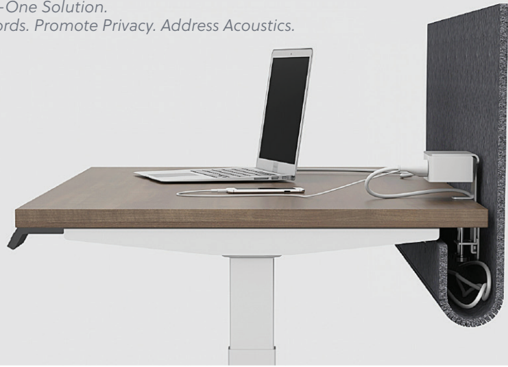
PET Wire Manager A Three-in-One Solution. Contain Cords. Promote Privacy. Address Acoustics.