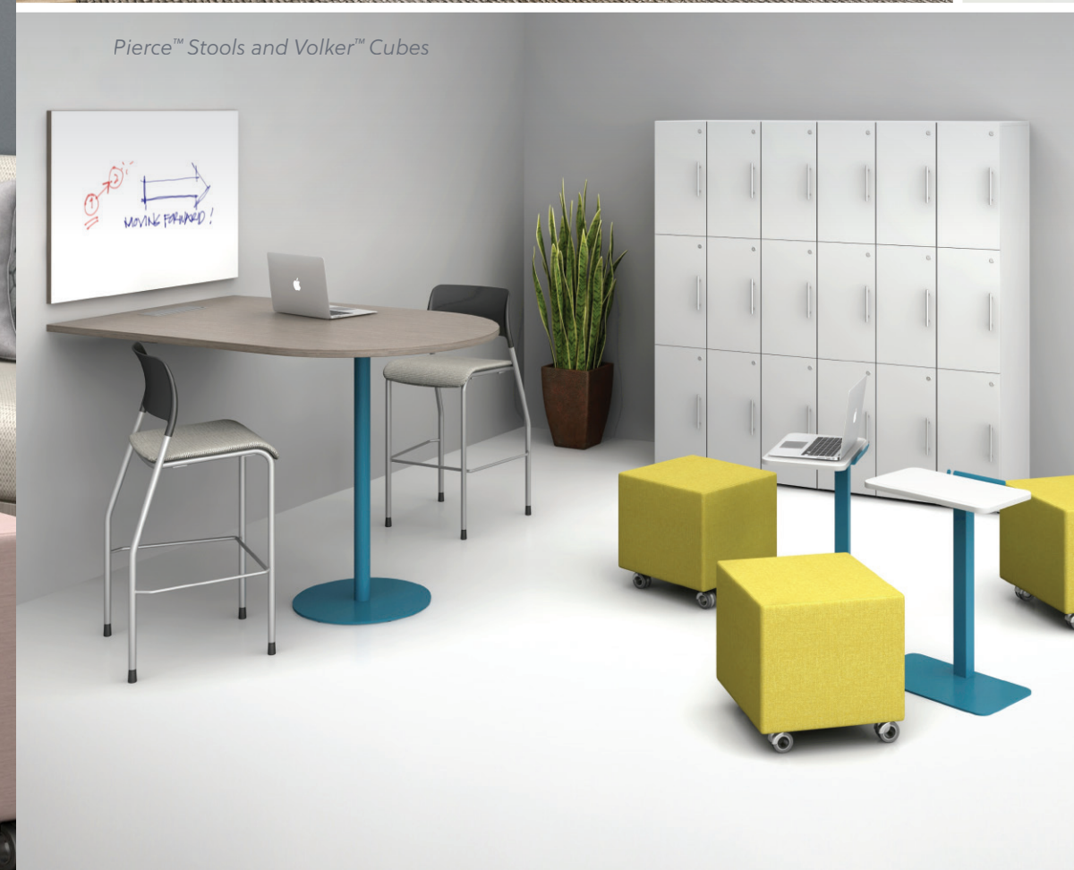
Pierce™ Stools and Volker™ Cubes

THERE'S SOMETHING FOR EVERY SPACE, FROM CASUAL LOUNGES TO PRIVATE SPACES.