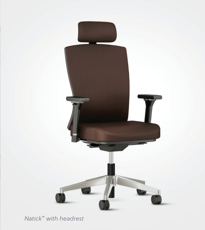
Natick™ with headrest