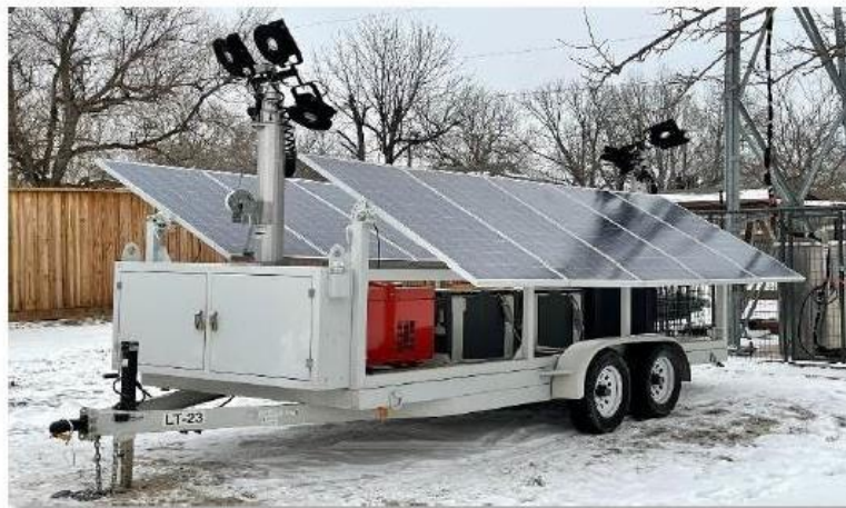
Figure 1 February 2021

In addition, Nextlink employs a Network Operations staff 24/7 that proactively monitors tower utilization and functionality. If a problem should arise, on-call infrastructure staff members are deployed immediately. These staff members have all the equipment necessary to replace malfunctioning parts to meet the SLAs (Service Level Agreements).