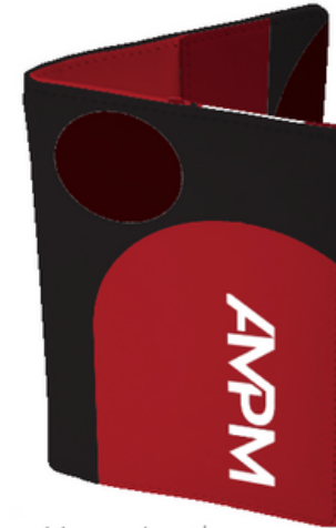
Vegan Leather Passport Case