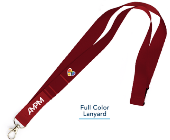
Full Color Lanyard