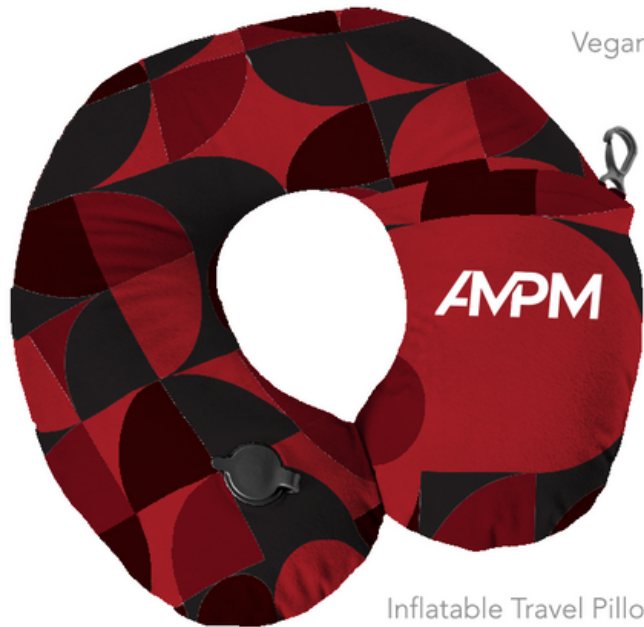
Inflatable Travel Pillow