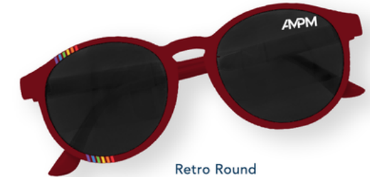
Retro Round Sunglasses