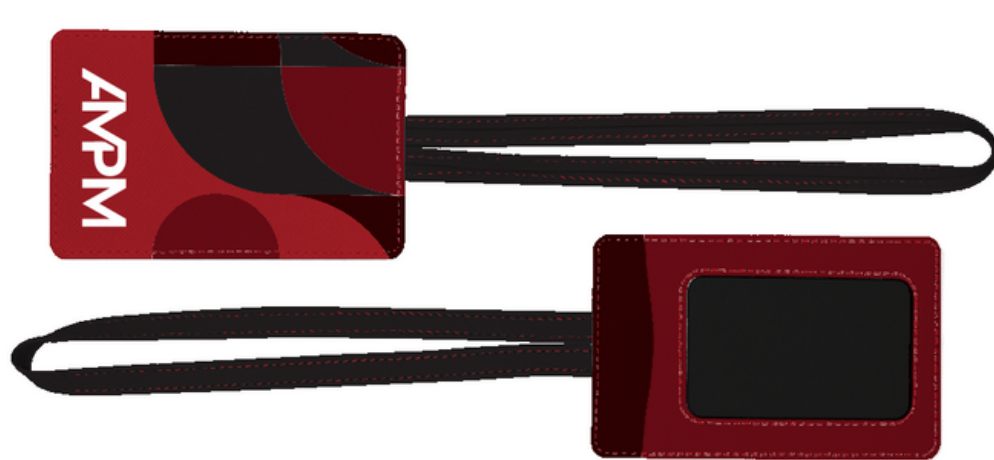
Vegan Leather Luggage Tag

We have the perfect collection of products to make any nurse feel appreciated. Help nurses feel comfortable and valued with our new Inflatable Neck Pillow, cozy custom Socks, or a Sleep Mask to make sure they are well rested wherever the road takes them!