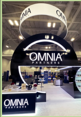
EXHIBIT DESIGN & PRODUCTION

Your complete system for turning trade shows and conferences into measurable, repeatable success—saving you time, reducing costs, and driving consistent growth across every event.