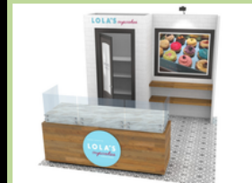
Exhibit design, production, and program management to built to engage, capture leads, and drive measurable ROI.