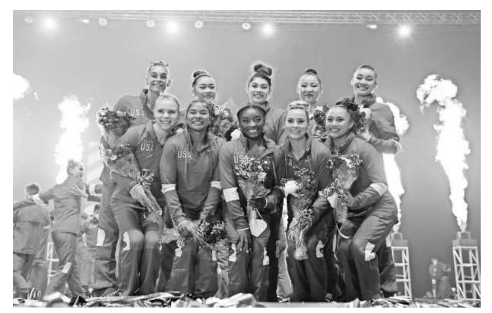
The members of the U.S. women's gymnastics Olympic team, including the alternates, shown at the team trials.