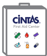
First Aid Cabinets

Make sure you're stocked up on supplies and prepared to respond quickly. Our regular on-site service has you covered — including replenishment of the first aid supplies you select, restocking of the safety products and PPE of your choice, AED servicing, and safety training.