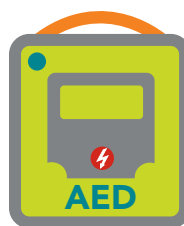
AED Products & Services