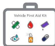
Vehicle First Aid Kits

For more information to get started contact Cintas at OmniaPartners@cintas.com .