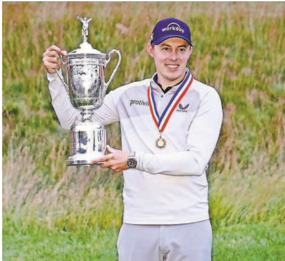
With his victory in the U.S. Open, Englishman Matt Fitzpatrick has risen from No. 18 to No. 10 in the Official World Golf Ranking.

On demanding golf courses like Southern Hills last month during the PGA Championship and this past week at The Country Club, which featured thick rough and fescue along the fairways, he ranked fifth in driving accuracy