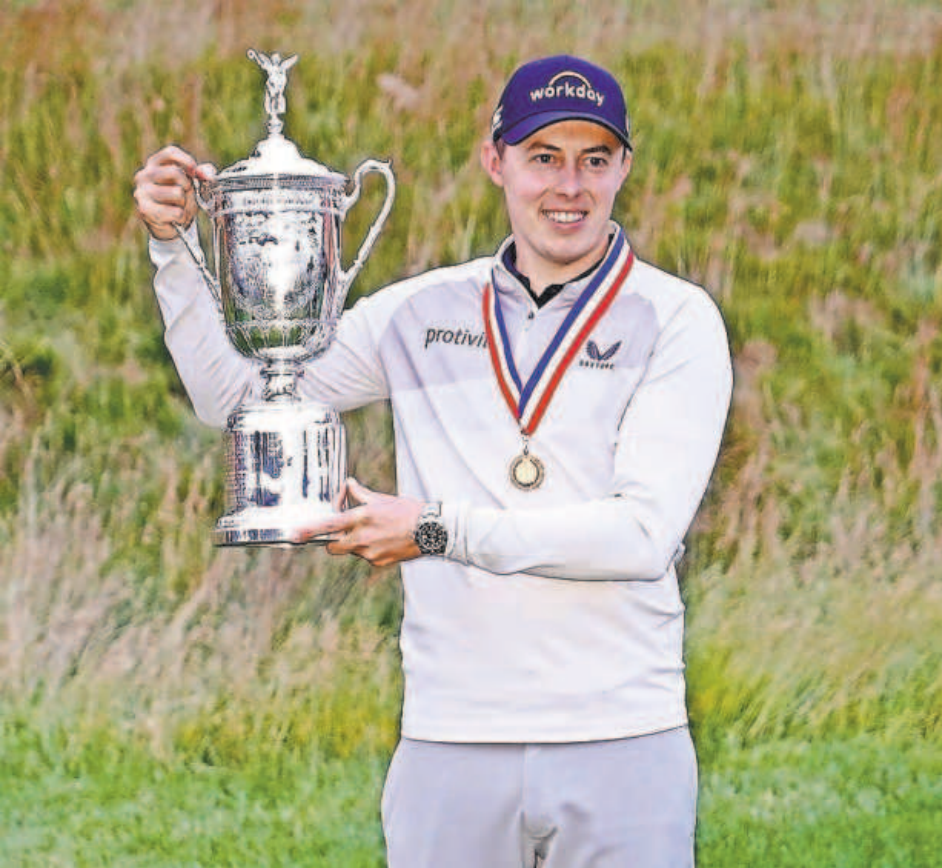
With his victory in the U.S. Open, Englishman Matt Fitzpatrick has risen from No. 18 to No. 10 in the Official World Golf Ranking.

cy and was 36th in driving average at 309 yards. Fitzpatrick is also legendary on tour for his work ethic. He has tracked every shot he has hit in competition and practice rounds for the last 12 years. If he continues to put in the work, more victories could be on the way.