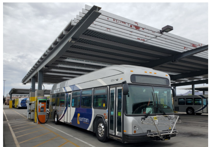
EV Charging Stations