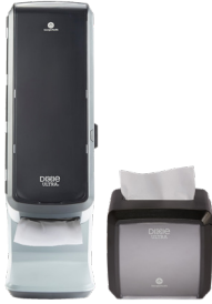
Dixie Ultra® Interfold Napkin Dispensers