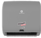
Brawny® Professional Automated Shop Towel Dispenser