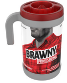
Brawny® Professional Cleaning Soap System