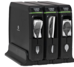
Dixie Ultra® SmartStock® Wrapped Cutlery Dispensers, Series-W, Triple Pack