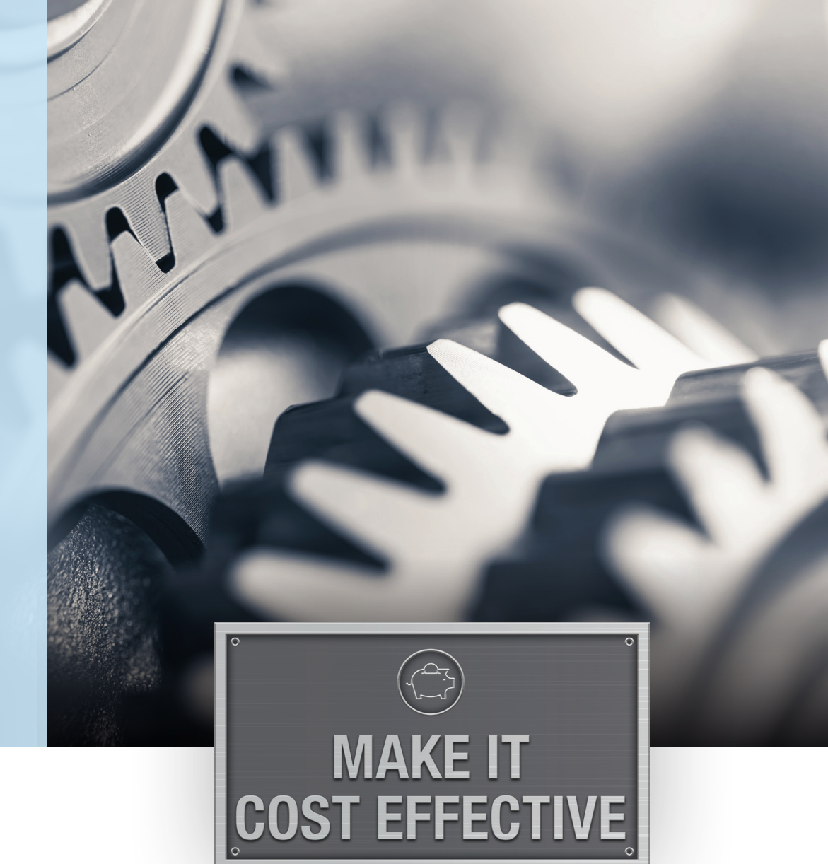
Help deliver cost savings through less consumption and waste

surveyed cited cost reduction as their primary driver of growth<sup>3</sup>