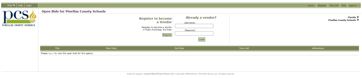
The Public | Group