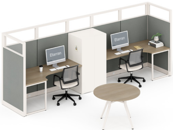
Inspire interaction while providing individual spaces.

From open configurations to those that offer more privacy, Etarran's flexible design accommodates all. Incorporate adjustable height worksurfaces and storage components to add more personalization.