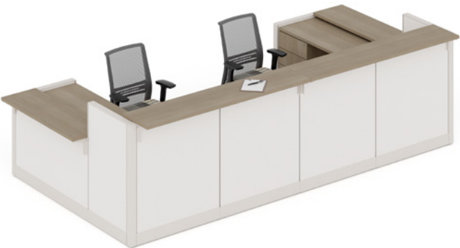
Create reception stations that welcome guests and encourage collaboration.

With Etarran, create the right setup for any situation. From single person touch down stations and work spaces to areas that invite collaboration and interaction, utilize Etarran to define spaces for a variety of activities.