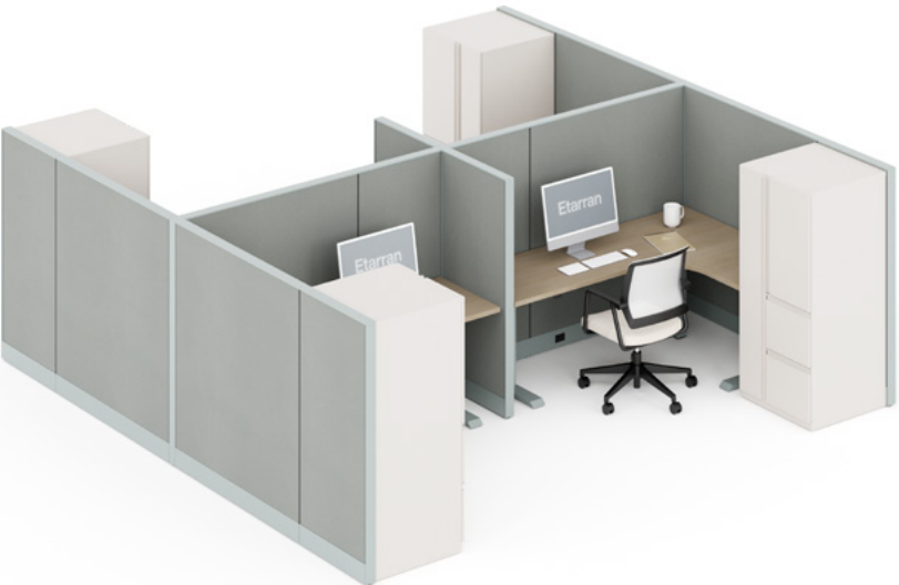
Etarran's flexibility makes it easy to design workstations that provide privacy.

With Etarran, create the right setup for any situation. From single person touch down stations and work spaces to areas that invite collaboration and interaction, utilize Etarran to define spaces for a variety of activities.