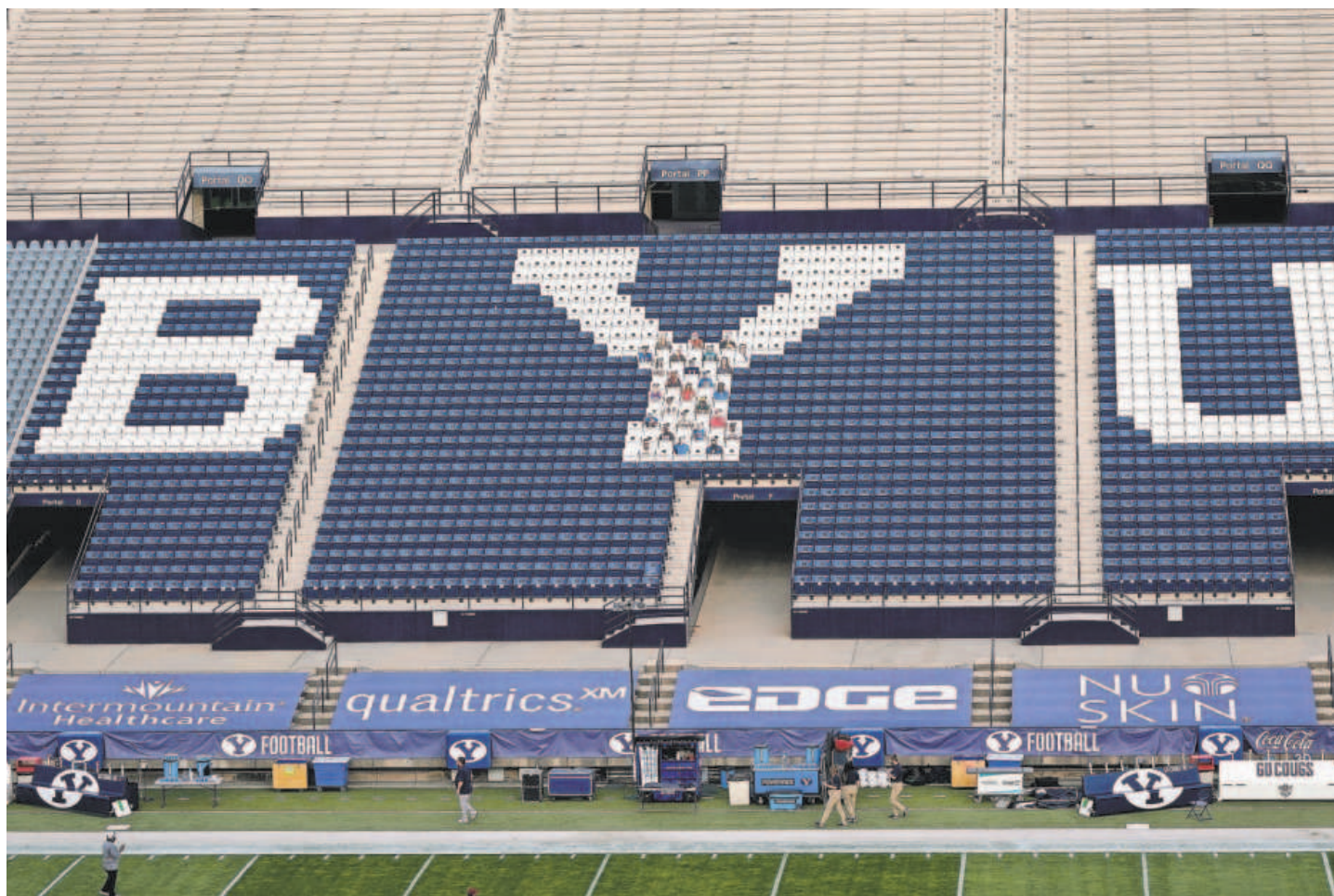
Enrollment at BYU is about 33,000 students, nearly all of whom are Mormon and less than 200 are Black.

Richardson's godmother, Lesa Pamplin, called BYU's investigation "a cover-up."