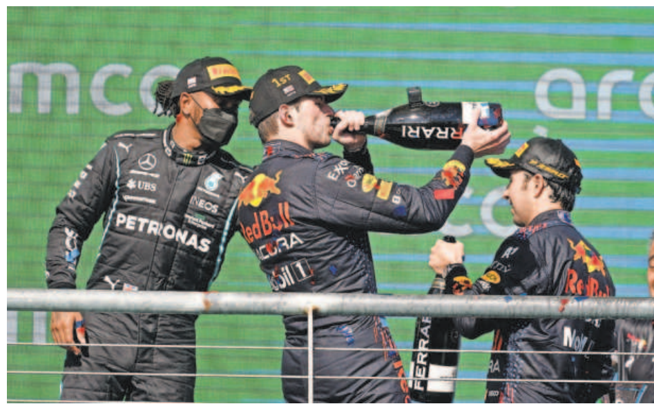
Red Bull driver Max Verstappen, center, Mercedes driver Lewis Hamilton, left, and Red Bull driver Sergio Perez celebrate following the Formula 1 U.S. Grand Prix in Austin, 2021.

ple 'I'll meet you back here next year,' and the same thing that's happening there happens with people that are staying in hotels but are coming back to Austin each year. Austin's been a great host city and we knew that it would be, but we just needed people to experience it."