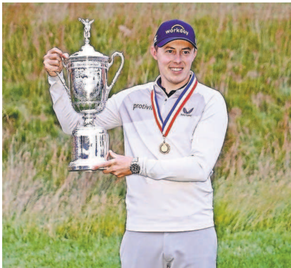
With his victory in the U.S. Open, Englishman Matt Fitzpatrick has risen from No. 18 to No. 10 in the Official World Golf Ranking.

On demanding golf courses like Southern Hills last month during the PGA Championship and this past week at The Country Club, which featured thick rough and fescue along the fairways, he ranked fifth in driving accuracy