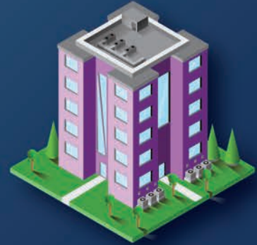
MID-RISE APARTMENTS Residential HVAC, roof top units, throughwall units