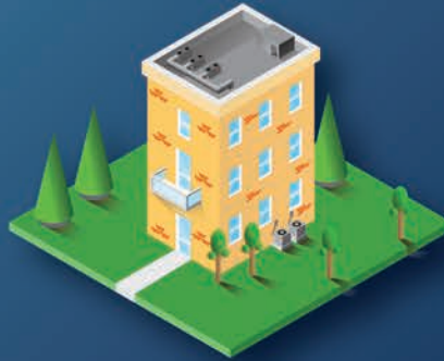
GARDEN STYLE APARTMENTS Residential HVAC, packaged units