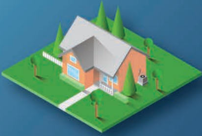
MILITARY HOUSING Residential HVAC

MOTILI SERVICES THESE TYPES OF MULTI-FAMILY PROPERTIES: