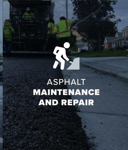
ASPHALT MAINTENANCE AND REPAIR