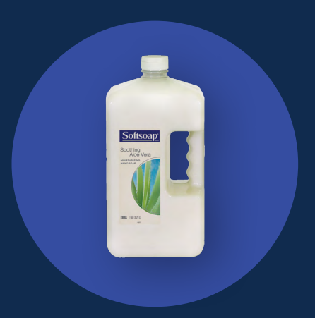
Softsoap® Moisturizing Liquid Soap 1 Gallon