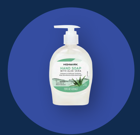
Highmark® Aloe Liquid Hand Soap 7.5 oz