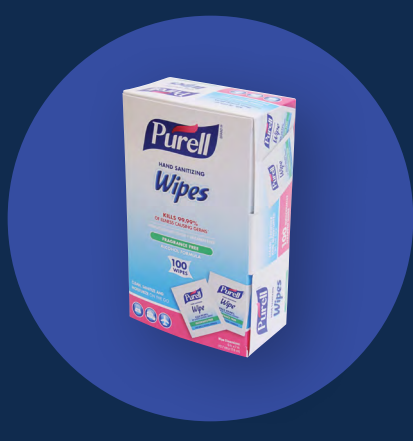
PURELL® Sanitizing Wipes Pack of 100 Item # 566410