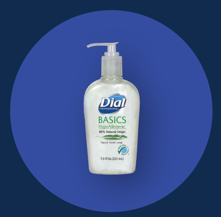
Dial® Basics Liquid Hand Soap 7.5 oz