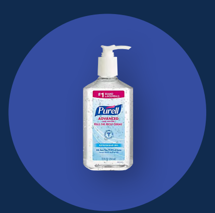
PURELL® Advanced Hand Sanitizer Refreshing Gel 12 fl oz