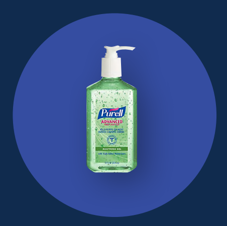
PURELL® Advanced Hand Sanitizer Soothing Gel 12 fl oz