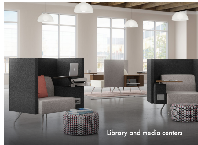
Library and media centers