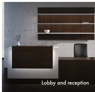
Lobby and reception