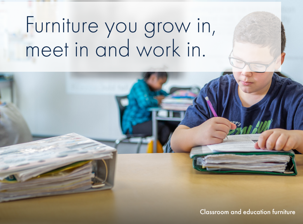
Classroom and education furniture

Furniture you grow in, meet in and work in.