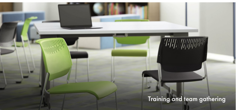
Training and team gathering