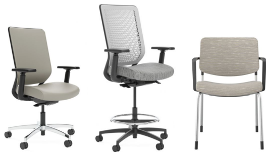
Genus task, stool, multi use