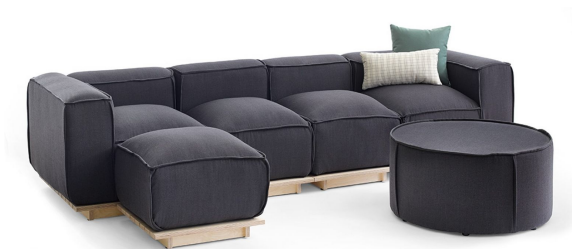
Hinchada modular lounge