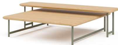
Rowen occasional tables