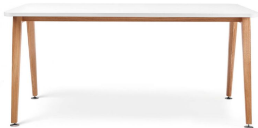
Eleven Wood tables