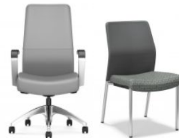
HB task, multi use