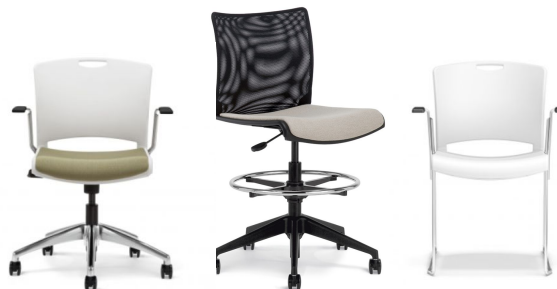
Quickstacker task, stool, multi use (book rack available)