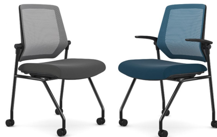
Acen multi use