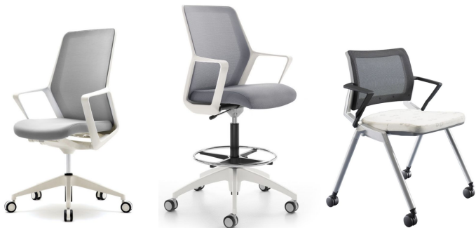
Flexxy task, stool, stack/nest