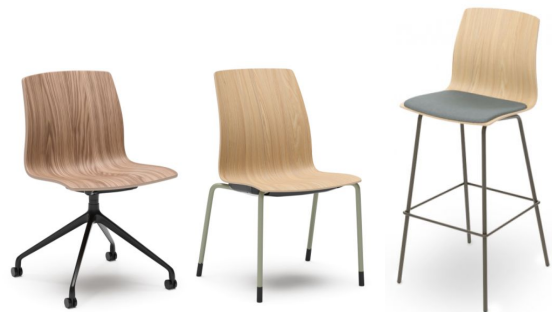
Harpin cafe/dining, stool