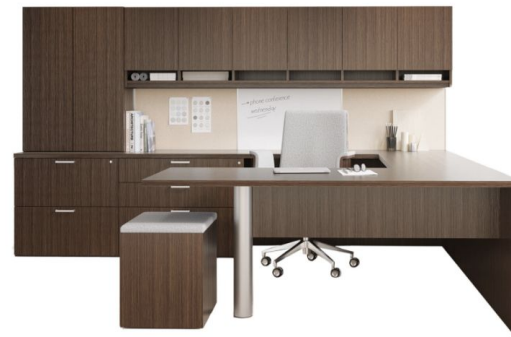
Impulse G2 workstations