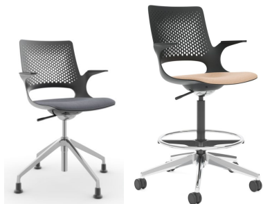
Binx task & stool