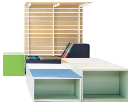
The Edge modular components