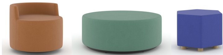
Mini Boost bench/ottoman