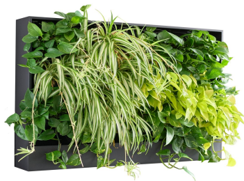
Living Wall Planter