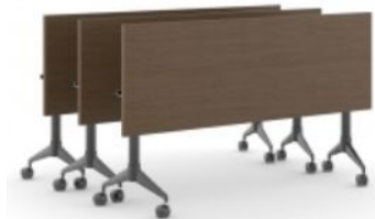
Applause tables (mobile or static)