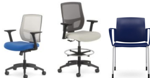
Airus task, stool, multi use