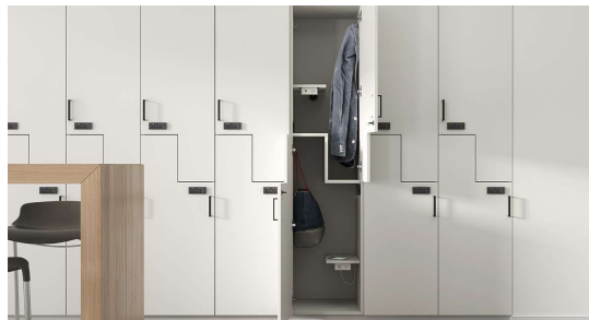
Mile Marker lockers