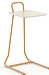
Lotiv personal table