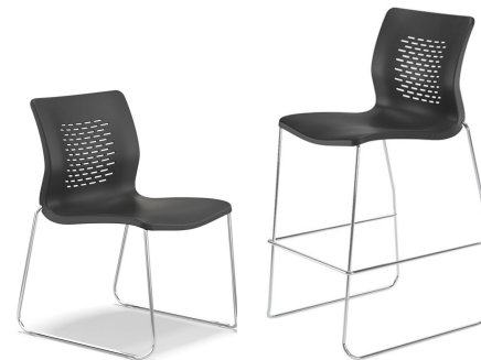
Intu stack & stool