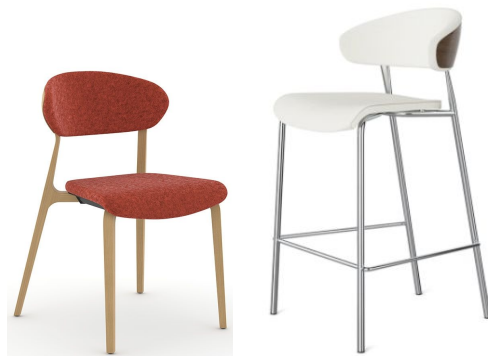
Bistro cafe/dining, stool