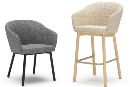
Kasura cafe/dining, stool