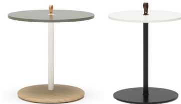
Strap occasional tables