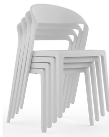
Sole multi use (outdoor)