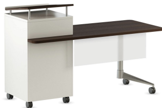
Layer teacher station