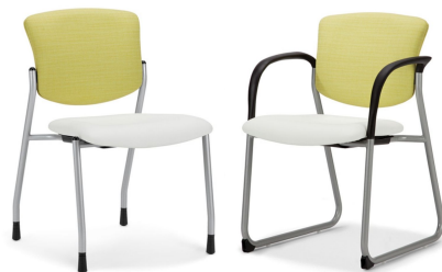
Lynx+ (book rack available)