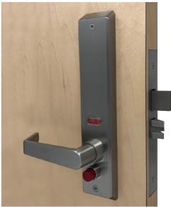
QUICK ACTION LOCKDOWN CLASSROOM LOCKS