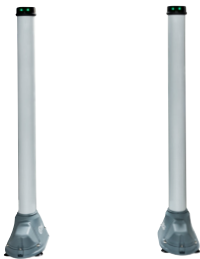
METAL AND WEAPONS DETECTION SYSTEMS