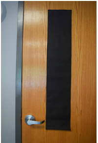
WEIGHTED LOCKDOWN WINDOW SHADE