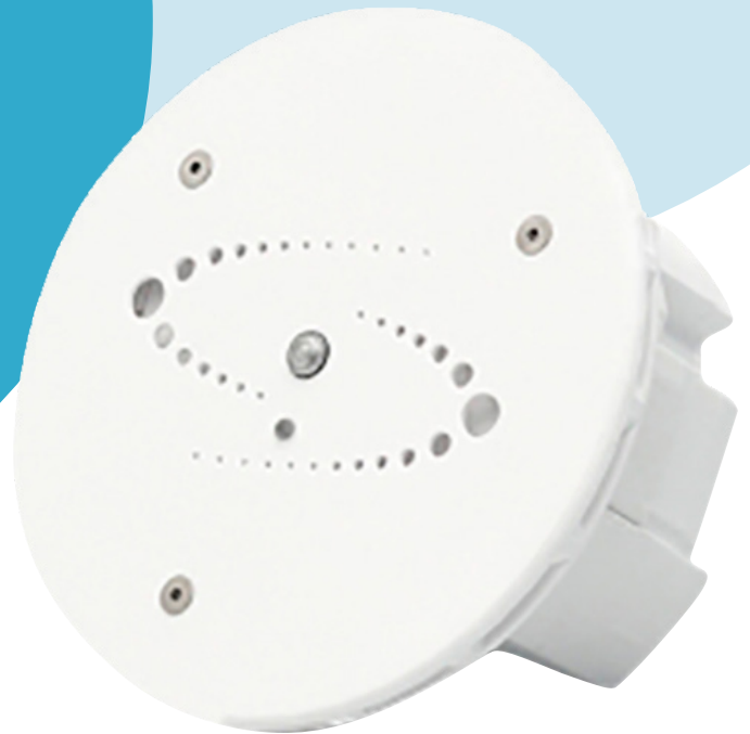
Item #2093106 School Monitoring & Surveillance Products