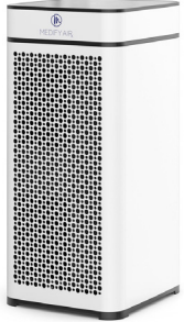
CLEAN AIR, UVC, PPE RELATED PRODUCTS