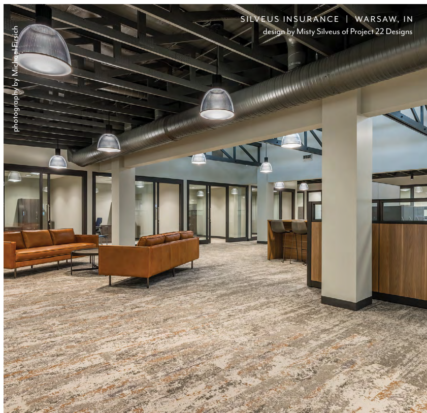
SILVEUS INSURANCE | WARSAW, IN design by Misty Silveus of Project 22 Designs