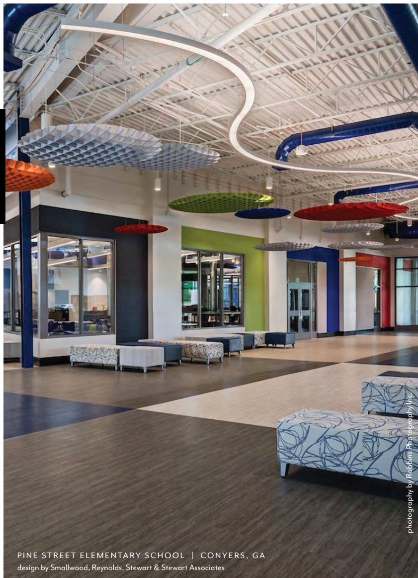
PINE STREET ELEMENTARY SCHOOL | CONYERS, GA design by Smallwood, Reynolds, Stewart & Stewart Associates