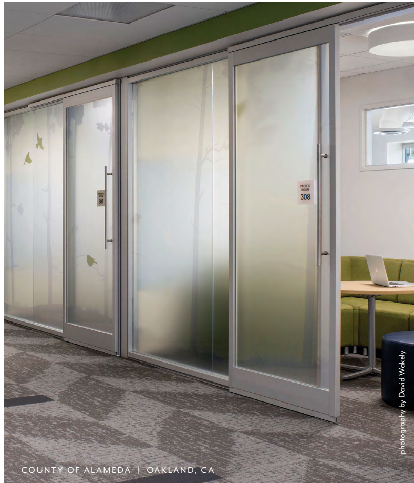
COUNTY OF ALAMEDA | OAKLAND, CA

For full contract documentation or more information, please visit: www.omniapartners.com/publicsector