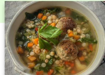
Plant-Based Italian Wedding Soup