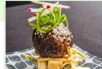
Korean BBQ Meatballs with Apple Fennel Slaw