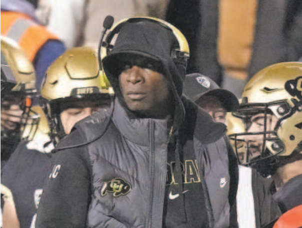
Colorado coach Deion Sanders and the Buffaloes face UCLA on Saturday. They need two more wins to be bowl-eligible.

Sanders was parodied on the show that aired Oct. 14, a day after his team lost to Stanford in double overtime, 46-43, after blowing a 29-0 lead. But this was his first public comment about it since comedian Kenan Thompson made fun of him and impersonated him. Sanders seemed to enjoy it. “I’m a fan of Kenan,” he said. “Let’s just get that straight. I love him. I love what he’s brought to comedy.” Sanders once hosted “Saturday Night Live” in 1995 and said the latest parody of him was “good” but didn’t