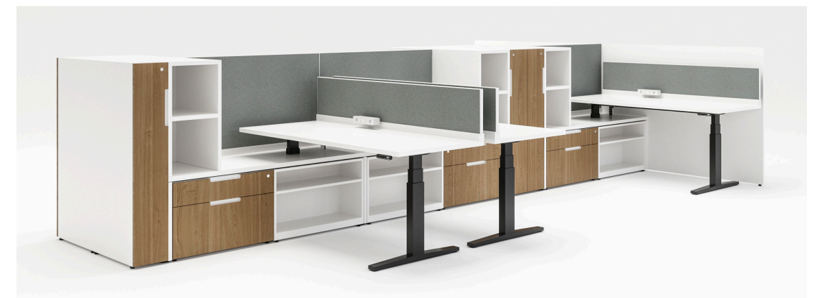
Above: Expansion Desking