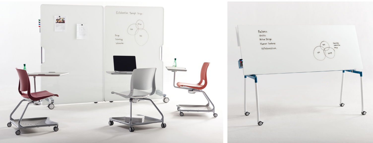
Above: Thesis Markerboard Above Right: Thesis Flip Top Table Right: Zones Lounge

Tables are increasingly important in today's evolving office environment. Teknion's integrated table designs are durable enough to withstand continuous use, so they're perfect for training facilities, conference centers, A/V rooms, presentation areas, call centers and cafeterias.