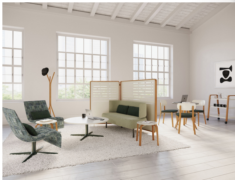
Above Left: Fractals Above Right: Bonds Right: Zones Workshop