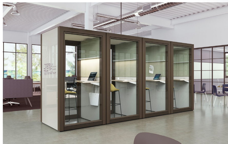
Above: Tek Room Right: Tek Booth