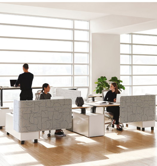
Bottom Right: Leverage