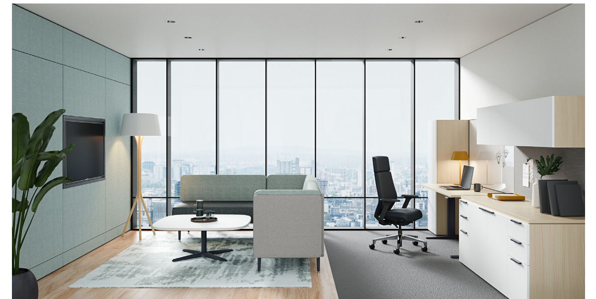
Above: Expansion Casegoods Right: Journal

You can use Teknion casegoods as stand-alone units or integrate them with other Teknion office products. Our components are flexible enough to accommodate a variety of tastes and budgets. You can even customize them for a distinctive appearance.