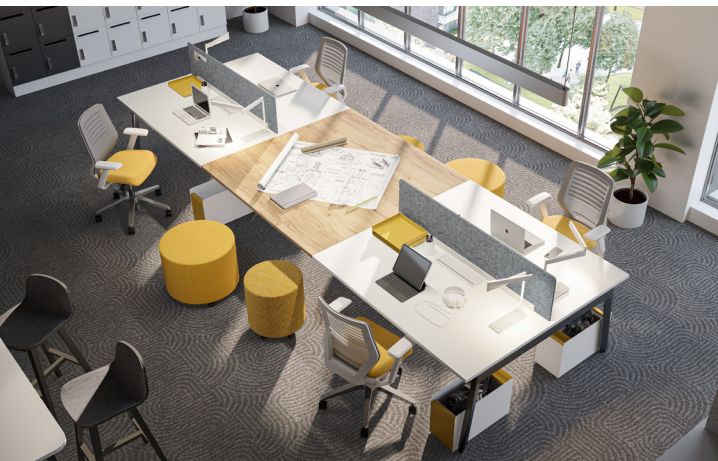
Left: Expansion Citybench

Teknion's innovative, integrated furniture has been at the forefront of the modern office for more than three decades. Adaptive and supremely functional, our office systems let you divide space, control privacy and enhance ergonomics without sacrificing comfort or aesthetics.