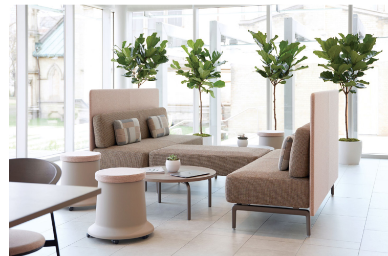
Above Left: Essa Guest Chair Above Right: Tone Left: Banqs Sofa