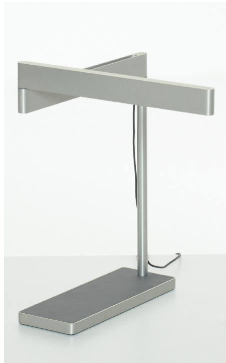
Above: Sanna Lightbar Top Right: unTethered Solo Charging Stand Bottom Right: Swerv XL

The Ergonomic Accessories collection includes monitor arms, keyboard trays, technology support holders, lighting products—all designed to work in tandem to give you more cohesive and efficient workspaces, and also enhance wellness and reduce the risk of discomfort and injury.