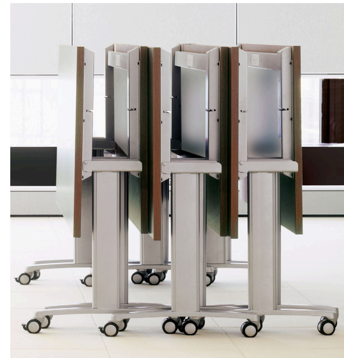
Above: Expansion Training

Infuse movement into your work space. The Height-Adjustable Bench provides each individual user the freedom to control their movement while working. Sit/stand height-adjustability allows users to frequently alternate their body posture throughout the work day.