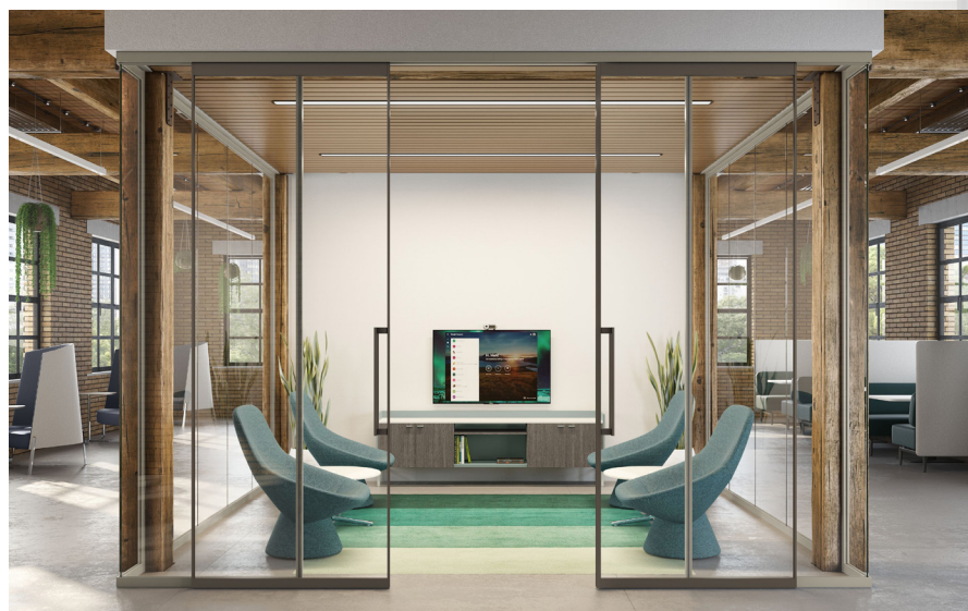
Above: Within Right: Tek Vue