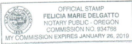
Notary Public-State of Oregon