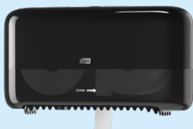
Tork Coreless High Capacity Toilet Paper Dispenser 473208