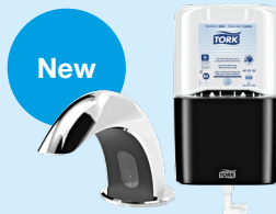
Tork Counter Mount Foam Soap Dispenser 571708