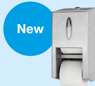
Tork Twin Coreless High Capacity Toilet Paper Dispenser 473430