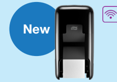
473528 Tork OptiServe® Coreless 2-Roll Toilet Paper Dispenser

No core, no wrap and a compact roll means less waste