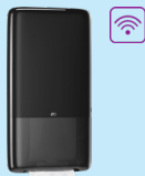
552528 Tork PeakServe® Continuous™ Hand Towel Dispenser

Control consumption and help reduce waste with one-at-a-time dispensing 2