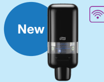
581508 Tork Soap and Sanitizer Dispenser

Clean more efficiently with fast refilling in less than 10 seconds 3