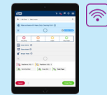
Tork Vision Cleaning The world's leading data-driven cleaning solution

Know exactly when and where to refill with data from connected dispensers and people counters. Reduce complaints by up to 75% 6