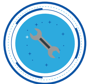
Flexible & Configurable