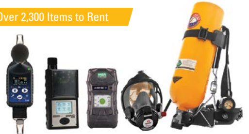
Over 2,300 Items to Rent