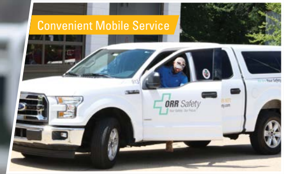
Convenient Mobile Service