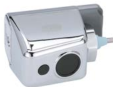
ZERK E-Z Flush® retrofit kit