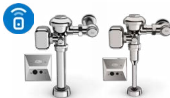
ZEMS6000 AquaSense® connected flush valve