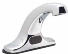
Z6915-XL AquaSense® sensor faucet