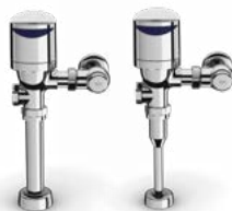
EZ Gear Technology Sensor flush valve