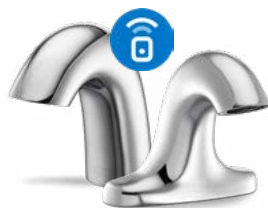
Serio® Series Connected faucets