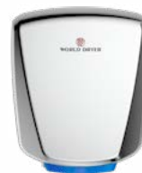
VERDEdri® HEPA-filtered sensor hand dryer