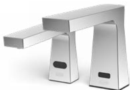
EZ Gear Technology Sensor faucet and soap dispenser