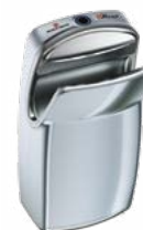
VMax® V2 HEPA-filtered vertical sensor hand dryer