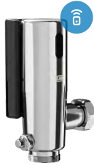
ZTR Series Smart Sensor Battery Retrofit Kit