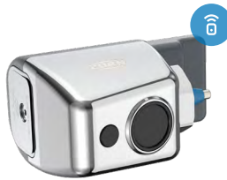
ZERK-W2 Smart Sensor Battery Retrofit Kit with vandal-resistant chrome metal cover