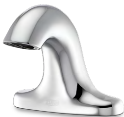
Z6955-XL-S Aqua-FIT® Sensor Faucet