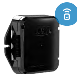
P6900-RK-W2 Connected Aqua-FIT Series® Battery Sensor Faucet Retrofit Kit