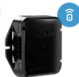
P6900-RK-W2 Connected Aqua-FIT Series® Battery Sensor Faucet Retrofit Kit