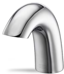
Z6950-XL-S Aqua-FIT® Sensor Faucet