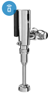
ZTR6203-W2 AquaSense ZTR Series Exposed Sensor Battery Smart Urinal Flush Valve