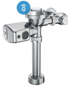
ZER6000AV-W2 AquaVantage® ZER Series Exposed Sensor Battery Smart Water Closet Flush Valve