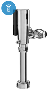
ZTR6200-W2 AquaSense® ZTR Series Exposed Sensor Battery Smart Water Closet Flush Valve