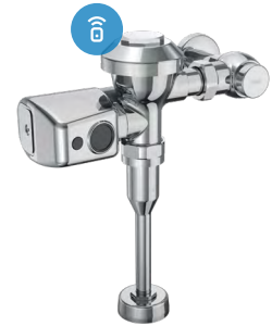
ZER6003AV-W2 AquaVantage ZER Series Exposed Sensor Battery Smart Urinal Flush Valve